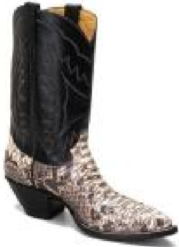
Chaplain Bob’s Python Boots

We have written articles in the past, on “ Tools of Ministry .” In each article we used items such as