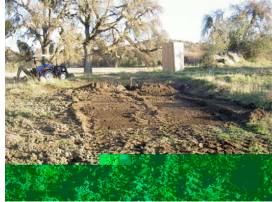
Clearing and leveling for concrete pad

The property is progressing slowly due to lack of finances, but still headed in a positive direction.