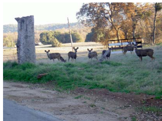
Local "wild" livestock watching activities. 7 deer in this picture.