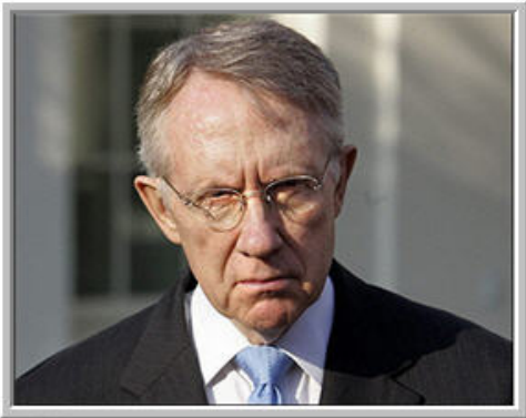
Sen. Harry Reid