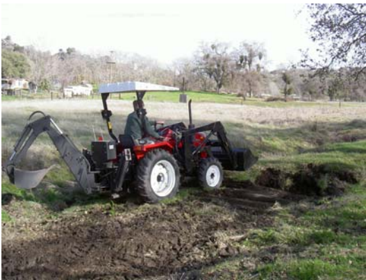
Start of digging swimming pond.