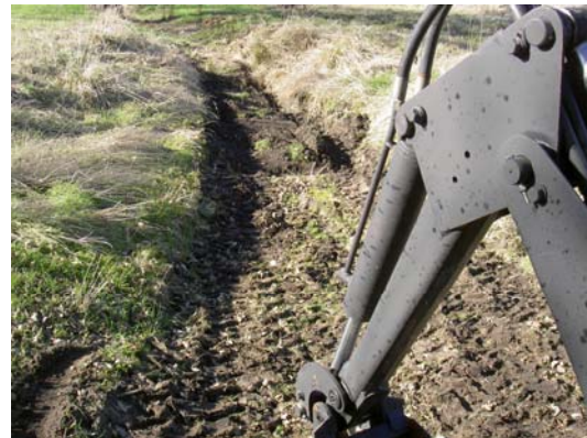
Clearing the creeks