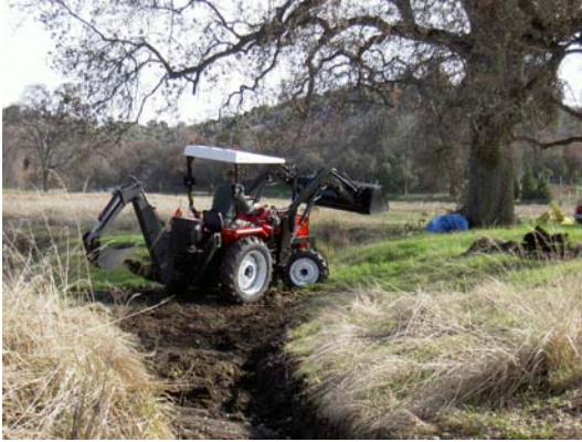
Clearing the creek and doing swimming hole.