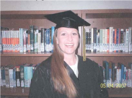
Cap and Gown Picture

This fine young lady has completed her GED program while in prison in Idaho. We are very proud of her