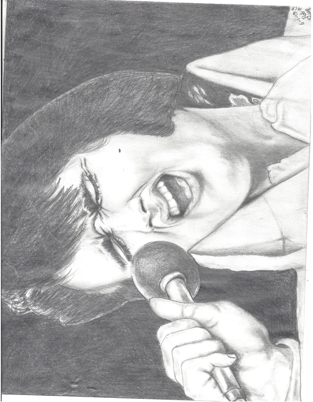
Linda found this drawing at a yard sale of possibly an estate and bought it for a quarter (sad when realizing the time and talent that went into it.)